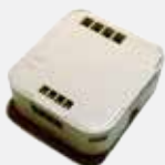
LIT-DWM-DHS Z-Wave In-Wall Dimmer Controller