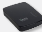
CON-VERAEDGE VeraEdge Home Controller