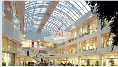
Businesses with semi-public areas (e.g. shopping malls)