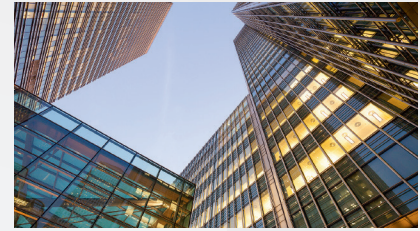
Companies and businesses