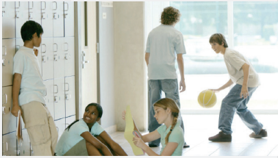
Public video surveillance (e.g. schools, universities)