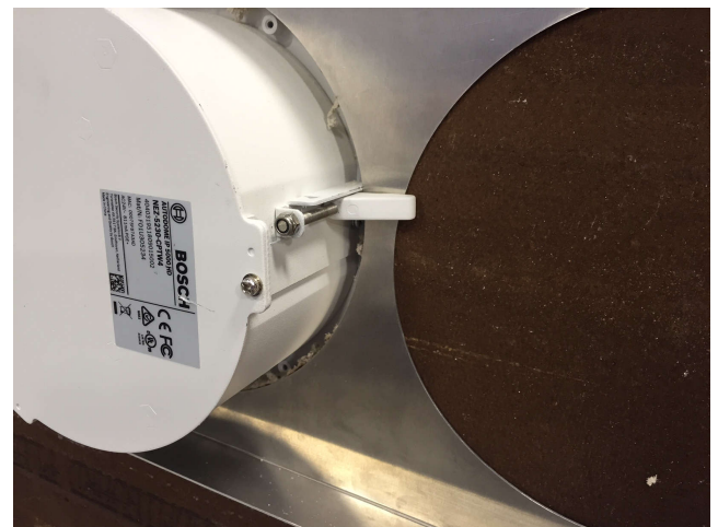
Example installation: in-ceiling AUTODOME IP 5000 HD camera clamped to MNT-ICP-ADC on top of ceiling tile