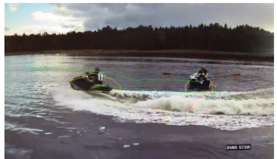
In most real-world conditions water is full of waves and the special “ship tracking” mode is needed