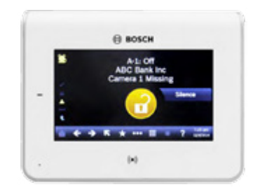
Camera missing: The intrusion system has lost supervision with IP camera #1 (e.g. camera is damaged)