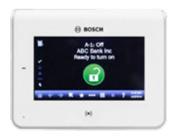
System normal: The intrusion system is supervising Bosch IP cameras with quality video

B and G Series both features Universal Plug and Play (UPnP) network technology which allows the system to self-configure with networks, providing simple installation, compatibility for remote programming and control over LAN, WAN, or Internet. Also, Bosch camera configuration tools detect and configure the cameras automatically while allowing quick setting changes.